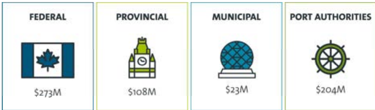
Figure ES-2: Annual Estimated Tax Revenues & Port Fees of BCMEA Maritime Employers, 2020

Note: Taxes collected by the federal and provincial governments include taxes paid by employers and employees such as personal income tax and corporate income tax. Municipal taxes included property taxes paid by BCMEA and its members. The amount collected by port authorities include port user fees and tenant rents.